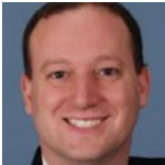
Mark Simos Lead Architect, Cybersecurity Solutions Group, Microsoft

Today's organizations need a new security model that more effectively adapts to the complexity of the modern environment, embraces the mobile workforce, and protects people, devices, apps, and data wherever they're located. Learn about how to mature in your zero trust journey.